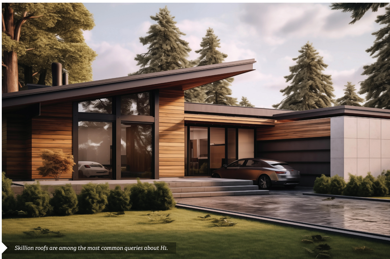
Skillion roofs are among the most common queries about HI.

to outlets at the highest edge of the roof – a ridge with outlet vents