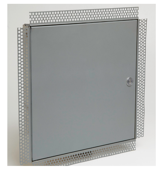
Pictured: CSNFPA Acc RW31