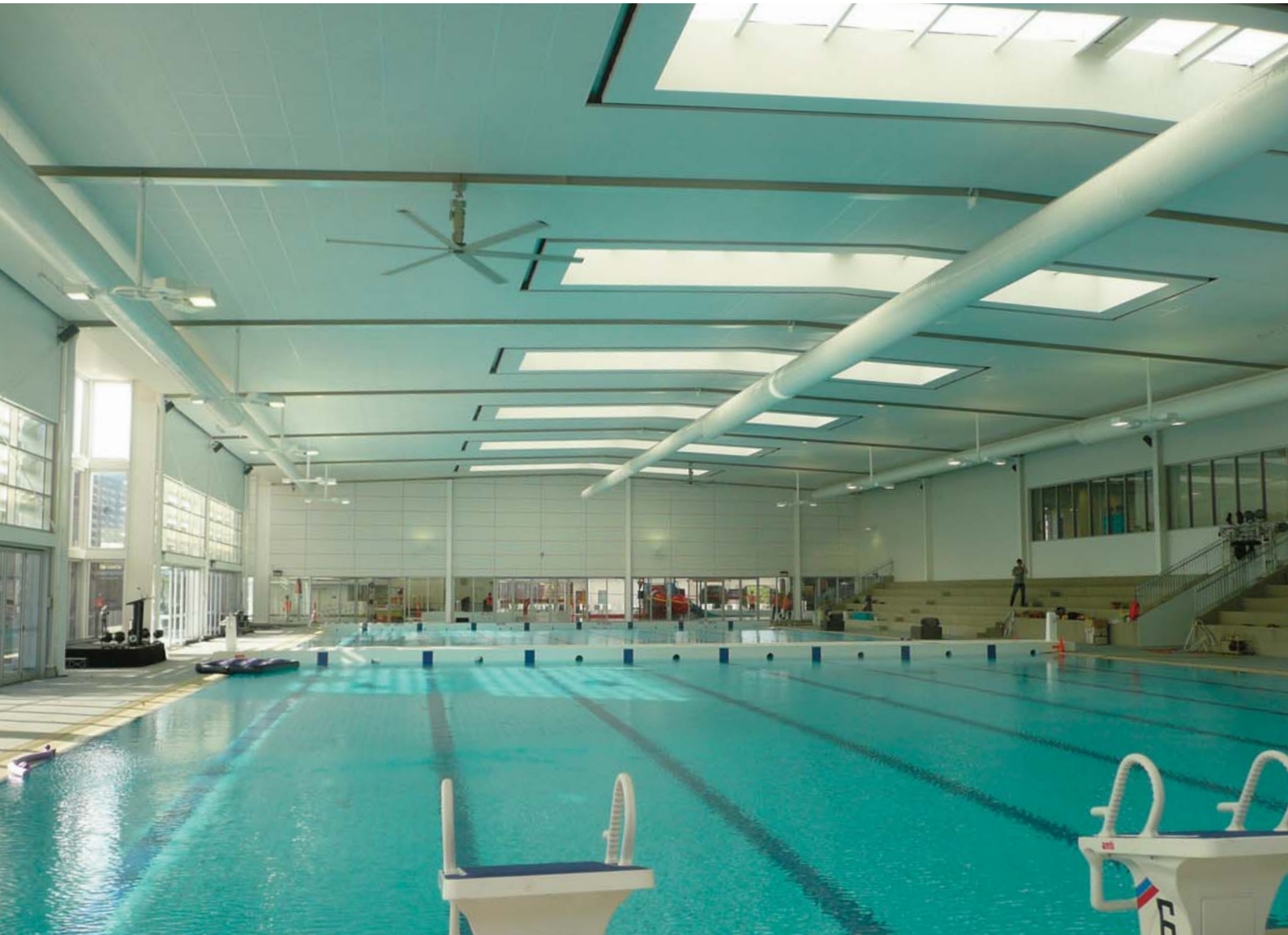
FINE FISSURED Ceramaguard with 24mm aluminium Exposed Tee grid