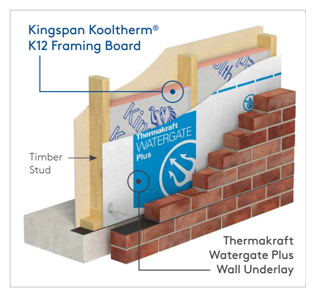
Figure 3. Kooltherm K12 Framing Board fitted between timber wall studs.