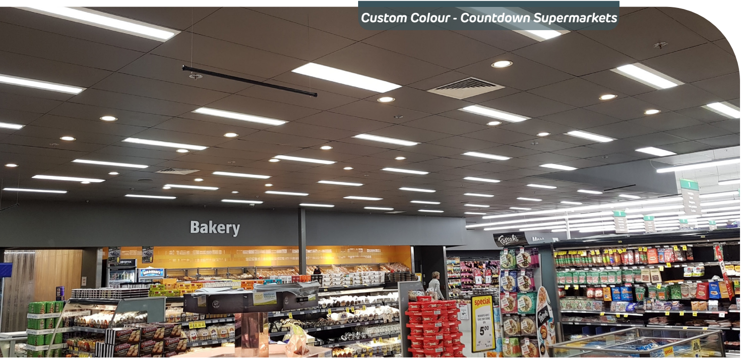
Custom Colour - Countdown Supermarkets