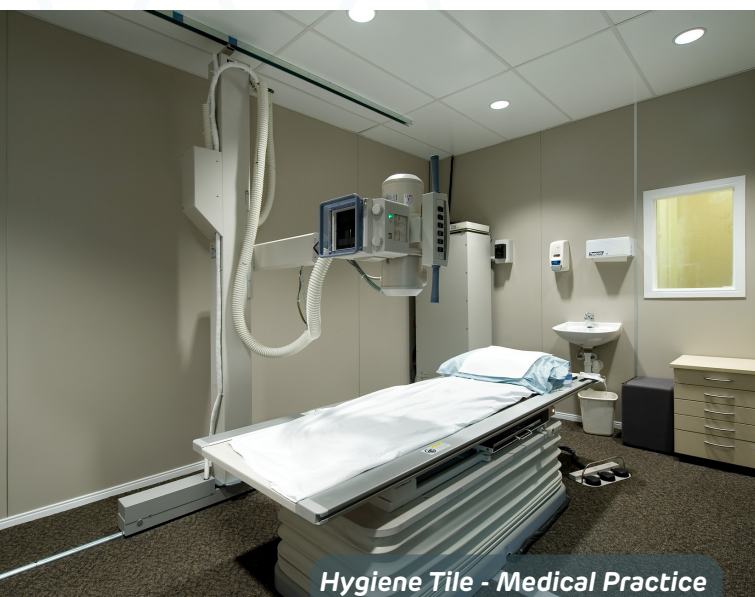
Hygiene Tile - Medical Practice