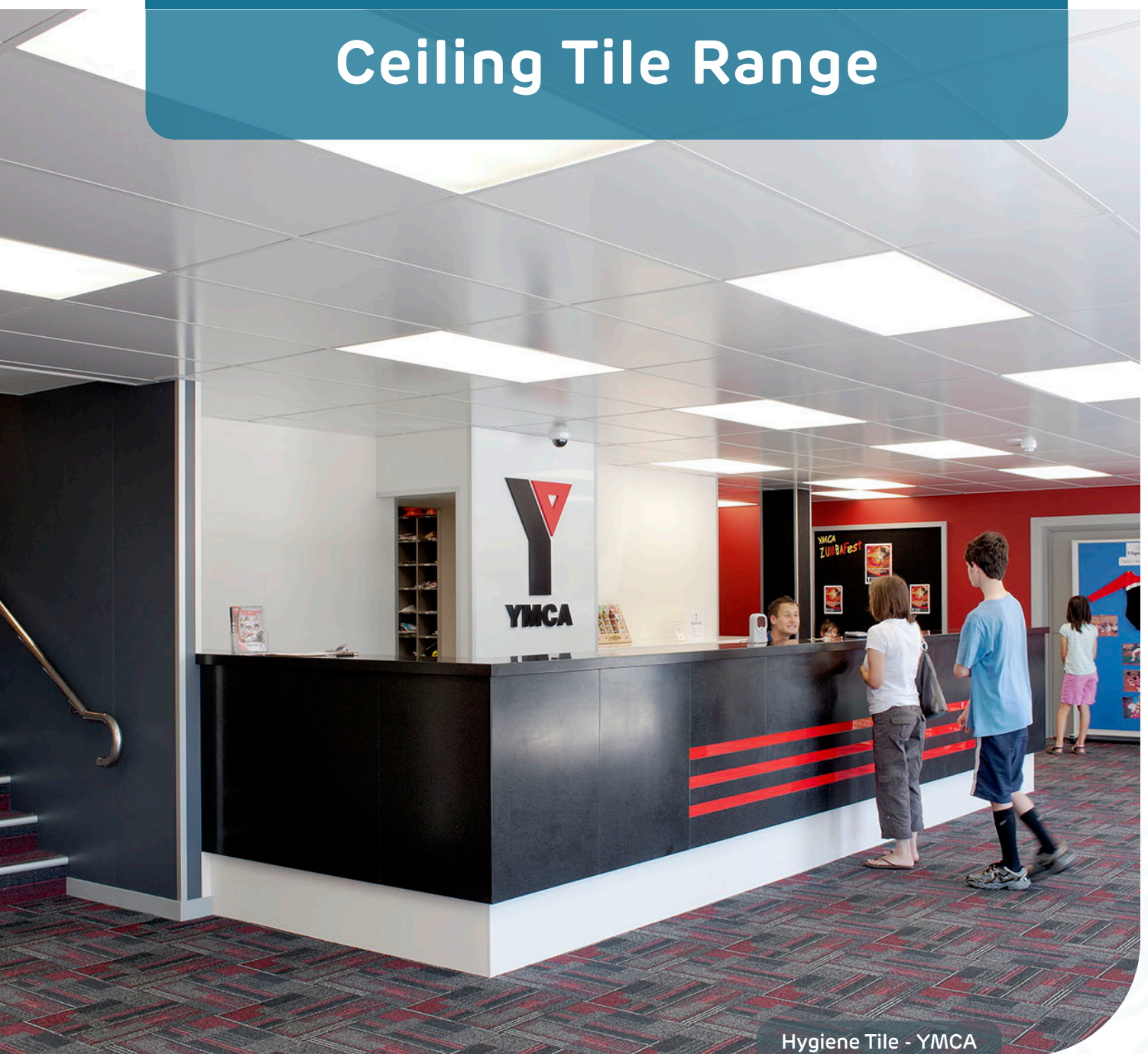
Hygiene Tile - YMCA

climate Y SURFACES ® climatesurfaces.com/ceiling_tiles